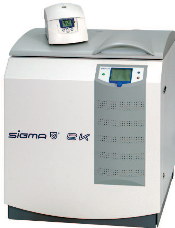
Delivery without microcentrifuge